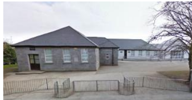
Ballinderreen National School