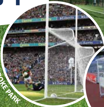
As used in CROKE PARK